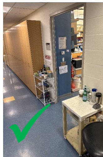
Photo: Food and drink are prohibited in the laboratories. A possible solution is placing a table outside the laboratory door that does not impede egress, where researchers can place their food/drinks before entering.

As always, please contact EH&S at labsafety@columbia.edu for any questions or guidance. Please note, the FDNY Laboratory Inspection Unit is on-site weekly at the Morningside and Irving Medical Center campuses. For a consultation before the FDNY inspector gets around to your laboratory, or for any question, concern, or help, please contact an EH&S Safety Advisor. https://research.columbia.edu/safety-advisor-team