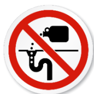
No Drain Disposal