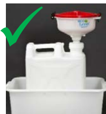
Specialty funnel with closed lid