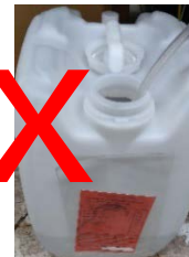
Open container with loose hose