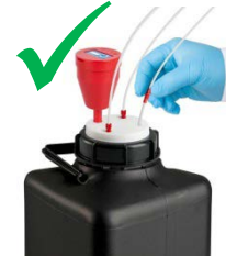
Specialty cap for HPLC waste