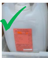
Waste collection in containers