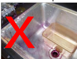
Stained sink due to drain disposal